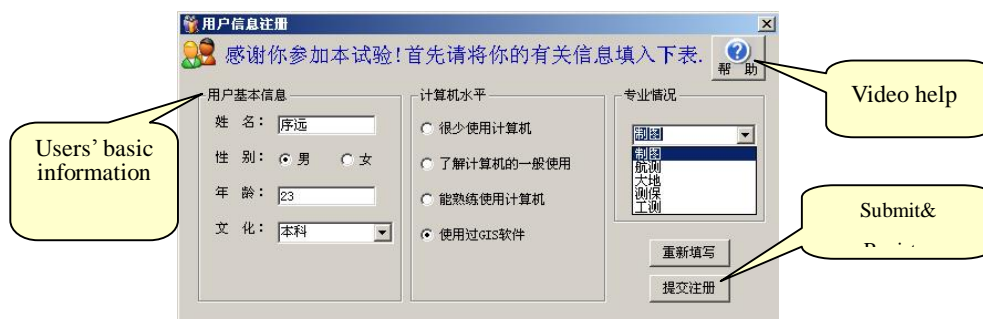
Figure 3. Subject registration dialog

At the first step of experiment, subject is required to register, subject input his or her basic information in a welcome dialog box as Figure 3, and submit it, then they may enter the next step of experiment.